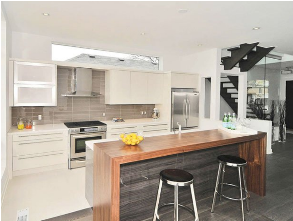
Inside, horizontal windows punctuate the space and flood the interior with natural light.